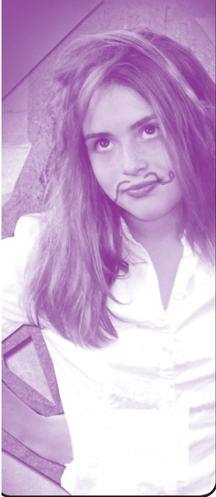
Art © 2008 by Merilee Liddard

After taking this tour, ask them to write a brief description of the land and the people who live there.